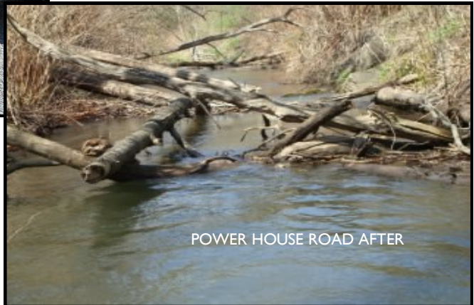
POWER HOUSE ROAD AFTER