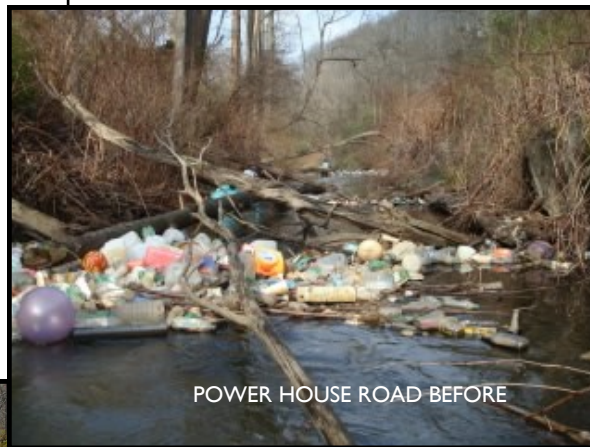
POWER HOUSE ROAD BEFORE

I have set April 18 as the date for next years' cleanup and a number of us have already made reservations at the Ashland Resort for the event. Mark your calendars and join us in a fun event that helps clean up the stream.